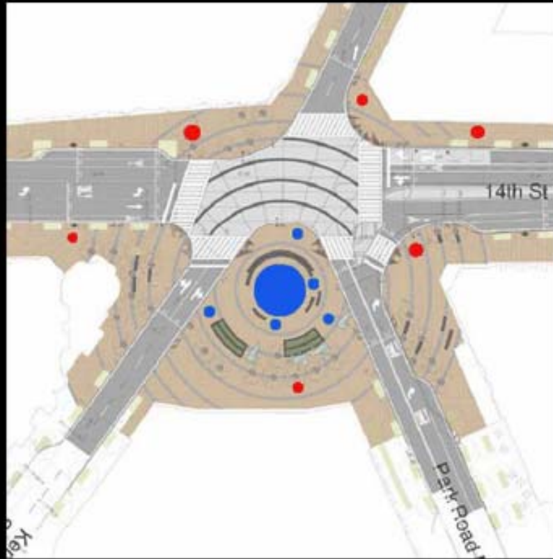
Plaza Site Plan